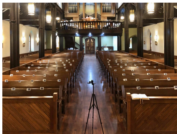
Photos of parishioners adorn the pews during a live-streamed service during the pandemic.

Since that time, Trinity has been impacted by two major natural disasters—Hurricane Fredric in 1979 and the Christmas night tornado in 2012—and of course by the COVID-19 pandemic. Through faith and resilience, we emerge from each challenge stronger and more deeply rooted in the power of community.